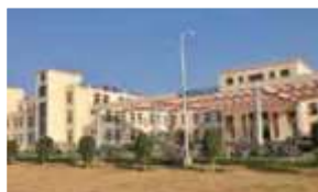
The ICFAI University, Jaipur