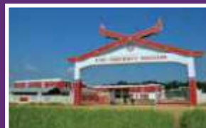
The ICFAI University, Nagaland