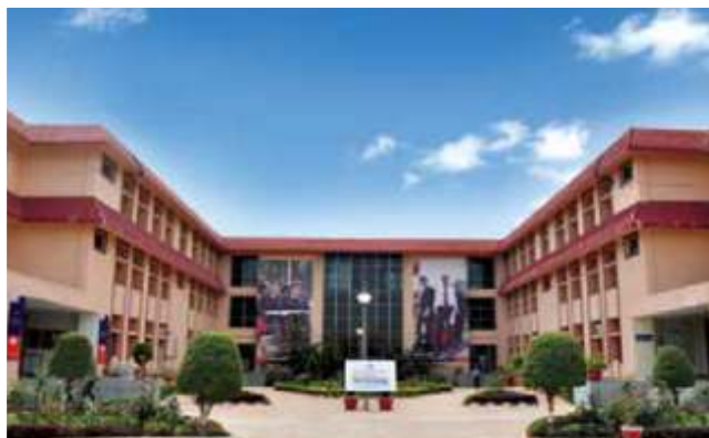
The ICFAI University, Dehradun