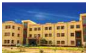
The ICFAI University, Raipur