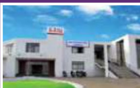
The ICFAI University, Jharkhand