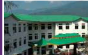
The ICFAI University, Sikkim