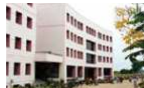
The ICFAI University, Tripura