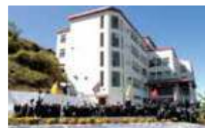
The ICFAI University, Mizoram