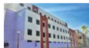
The ICFAI University, Himachal Pradesh (Baddi)