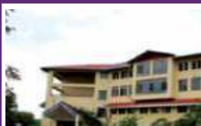
The ICFAI University, Meghalaya